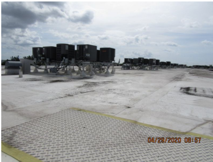
Membrane Roof Covering