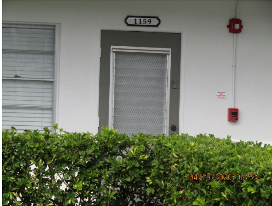
Unprotected Glazed Door