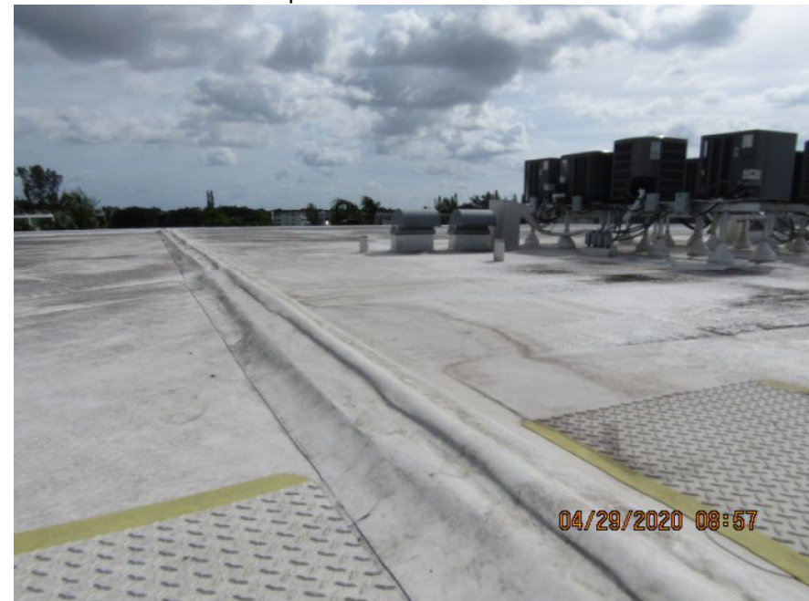
Membrane Roof Covering